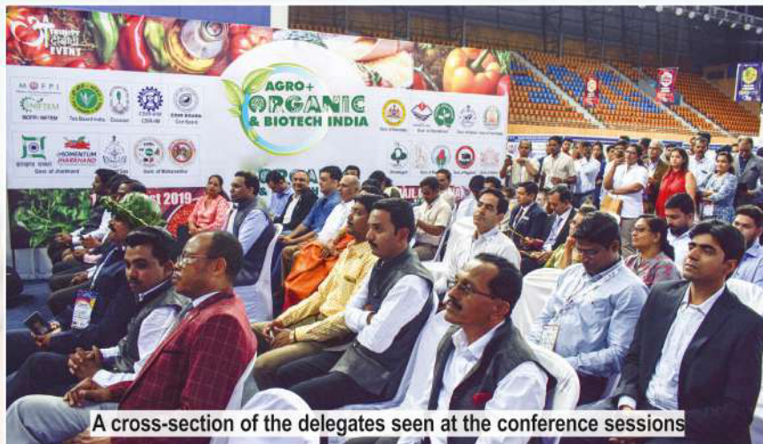
A cross-section of the delegates seen at the conference sessions