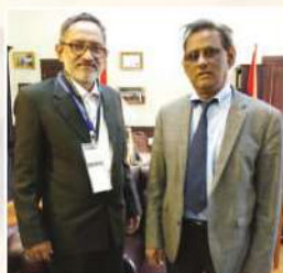
President of Mauritius & CMD of Impex Chamber