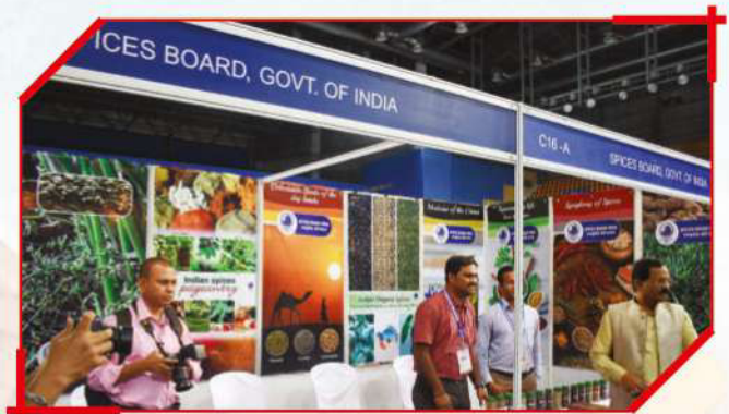
Spices Board, Government of India Ministry of Industry & Commerce