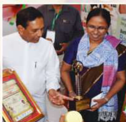
Sri Lankan Minister & Kerala Health Minister