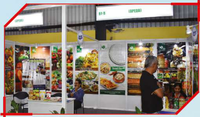
APEDA Pavilion - Agricultural Products Export Dev. Authority, Ministry of Industry & Commerce