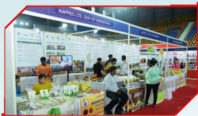
KAPPEC, Government of Karnataka