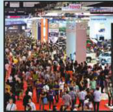
In Venue Displays