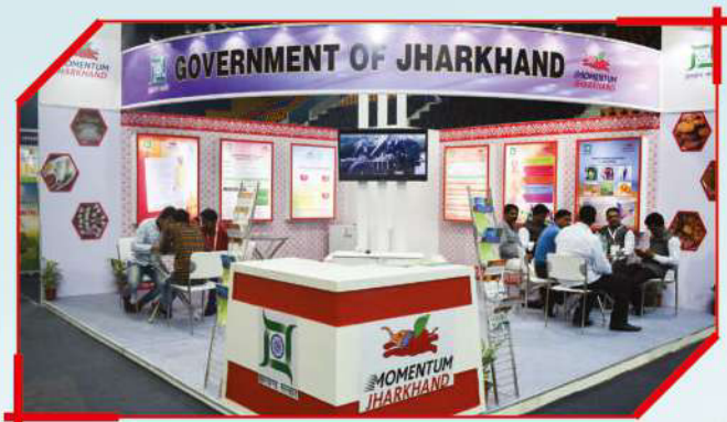
Government of Jharkhand