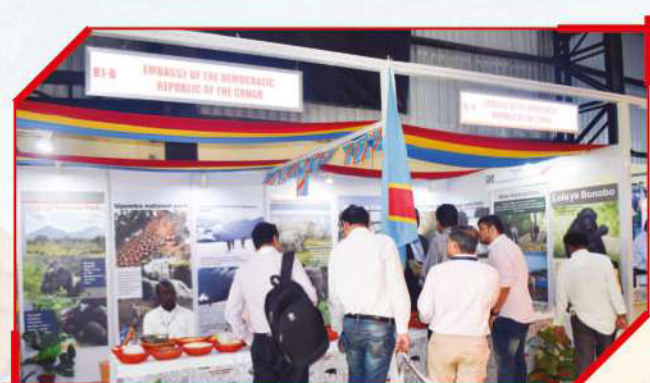
Republic of Congo