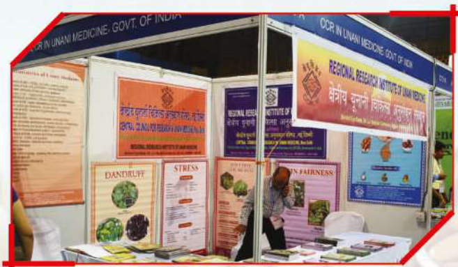
Central Council for Research in Unani Medicine - CCRUM