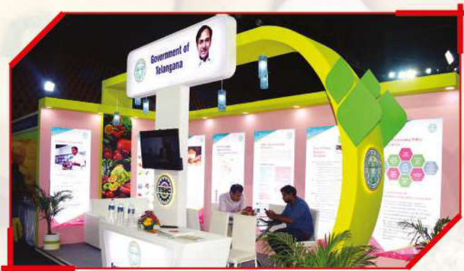
Government of Telangana