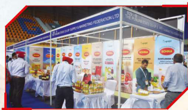
Government of Punjab