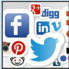
Social Media & Telecom