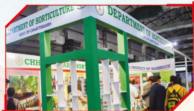
Government of Chhattisgarh - Horticulture Dept.