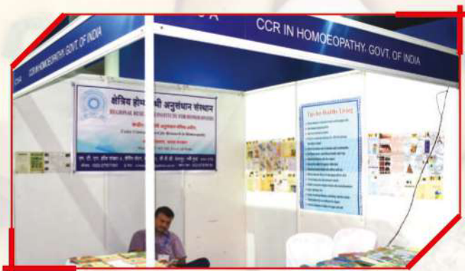
Central Council for Research in Homoeopathy - CCRH