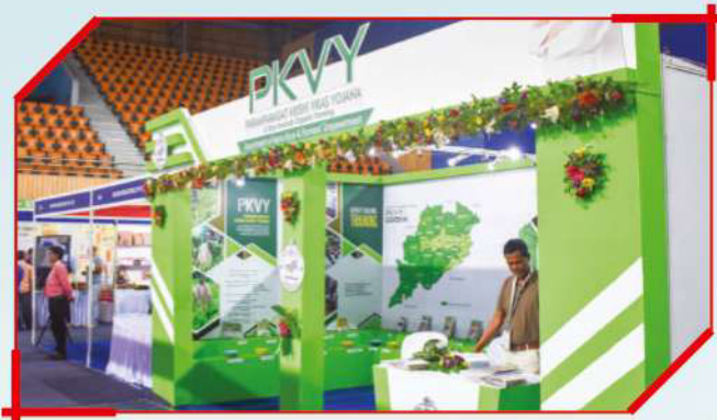
Government of Odisha