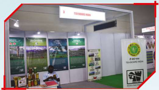
Tea Board, Government of India Ministry of Industry & Commerce