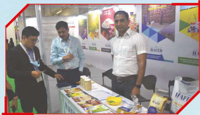
Government of Haryana - HAFED