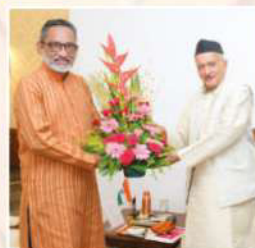
Governor of Maharashtra & Impex Chamber Mg. Dir.