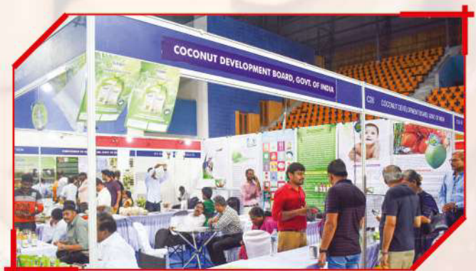
Coconut Development Board, Govt of India Ministry of Agriculture