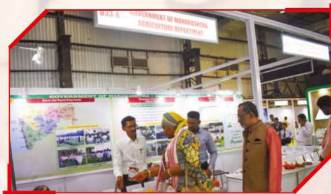
Government of Maharashtra - ATMA