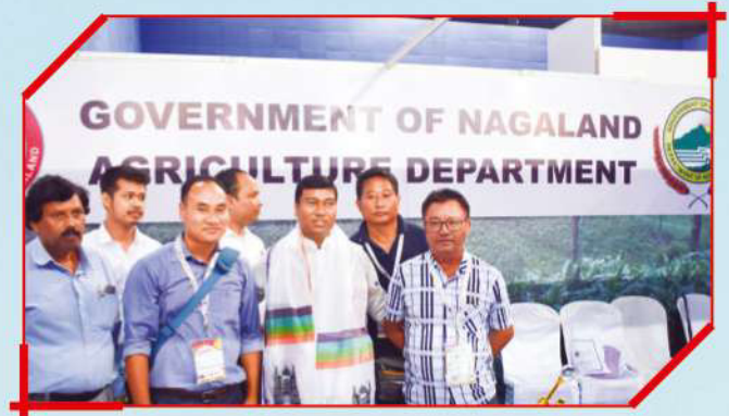
Government of Nagaland