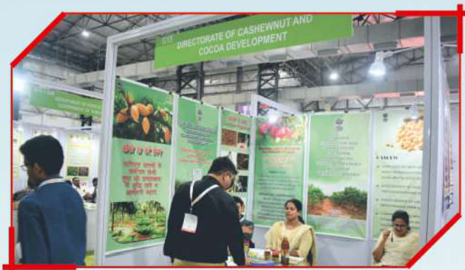
Directorate of Cashewnut and Cocoa Development