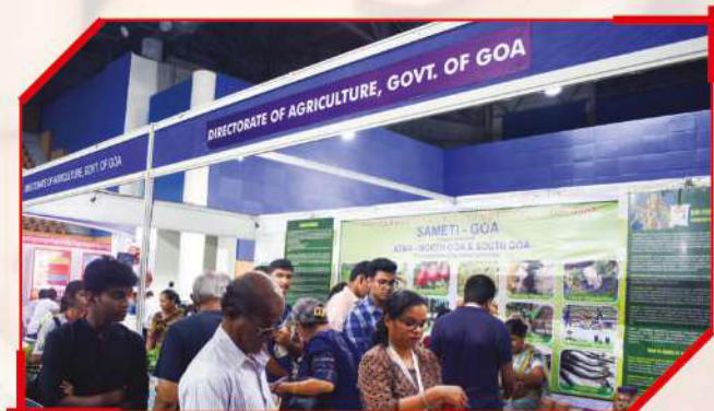
Government of Goa