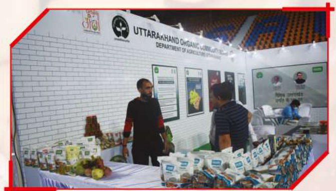
Government of Uttarakhand