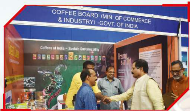
Coffee Board, Government of India Ministry of Industry & Commerce