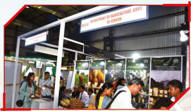
Government of Sikkim