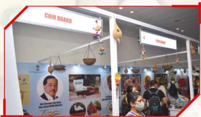
Coir Board, Government of India Ministry of MSME