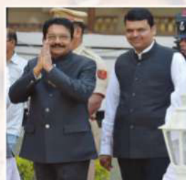
H. E. Governor Rao & CM Fadnavis of Maharashtra