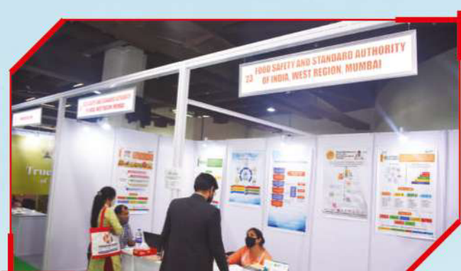
FSSAI - Food Safety and Standards Authority of India, Govt. of India