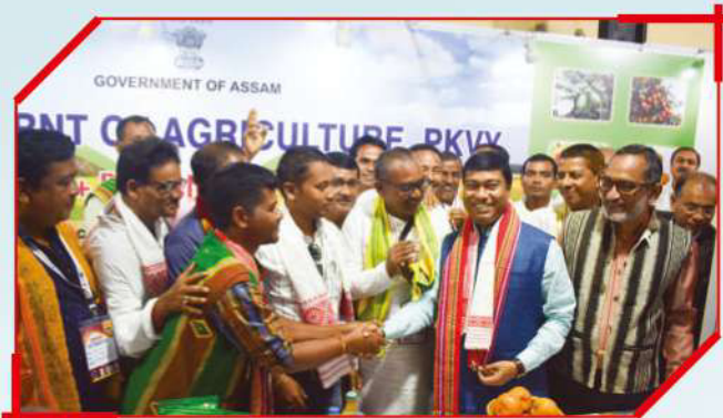
Government of Assam - PKYY & MOVCD