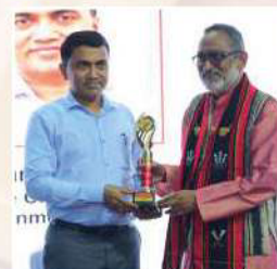
Hon Chief Minister of Goa & Impex Chamber Mg. Dir.