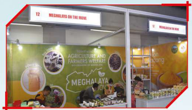
Government of Meghalaya