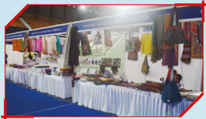
Khadi & Village Industries Corporation