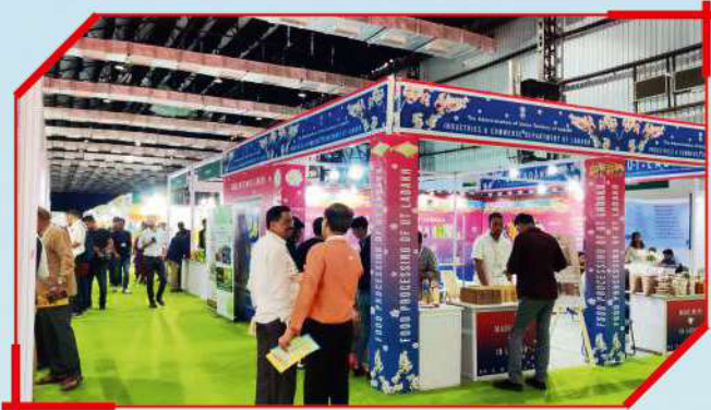
Food Processing Of UT Ladakh