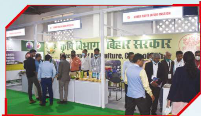
Government of Bihar