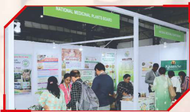
National Medicinal Plants Board of India - NMPB