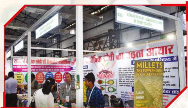
Government of Chhattisgarh - Agriculture Dept.