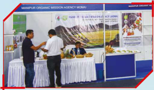
Government of Manipur - MOMA