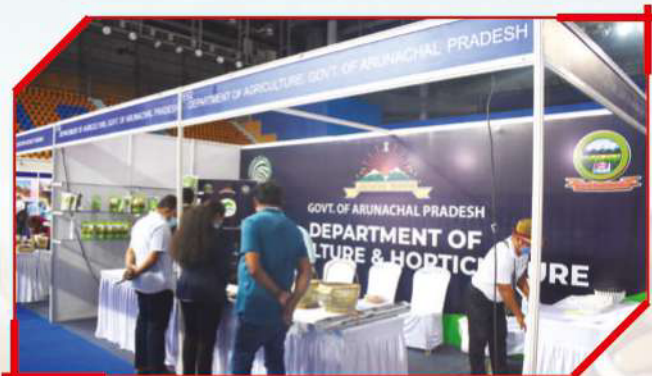
Government of Arunachal Pradesh