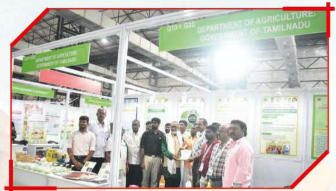
Government of Tamil Nadu