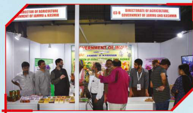
Government of Jammu & Kashmir