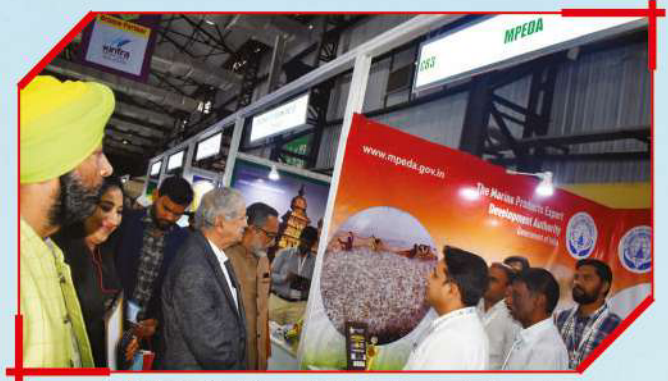
MPEDA Pavilion - Marine Products Export Dev. Authority, Ministry of Industry & Commerce