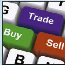
Associations & Chambers