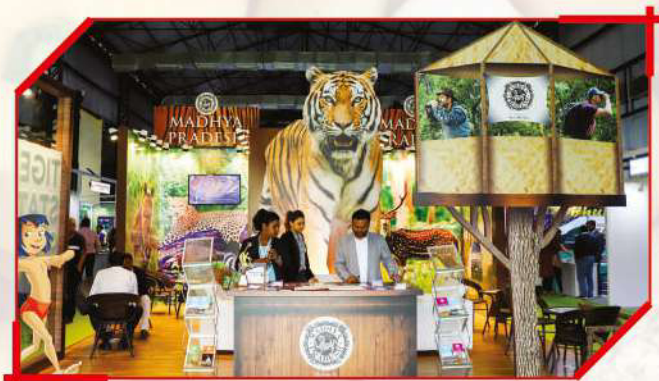
Government of Madhya Pradesh