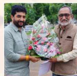
Shri Murlidhar Mohol, Union Minister & Trinity Chairman