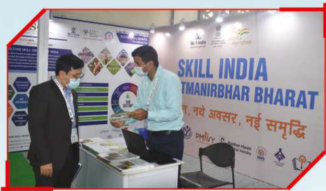
Skill India Atmanirbhar Bharat