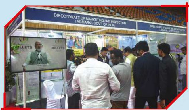
Directorate of Marketing & Inspection (AGMARK), Govt. of India