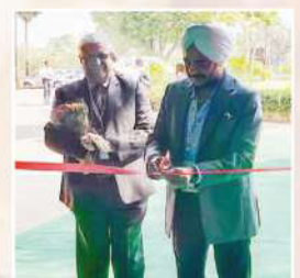
Hotels & Restaurants Association President