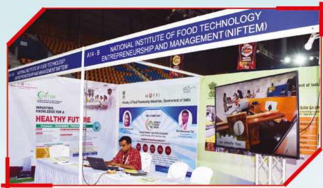
Ministry of Food Processing, Govt of India - National Institute of Food Tech, Entrepreneurs & Mgmt - NIFTEM