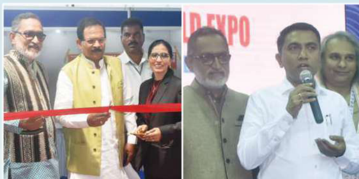
Shri Shripad Naik, Union Minister of State and Dr. Pramod Sawant, Chief Minister of Goa are seen inaugurating & speaking at Trinity's earlier events. Besides these VIPs, a number of foreign, central & state government dignitaries attended these events.