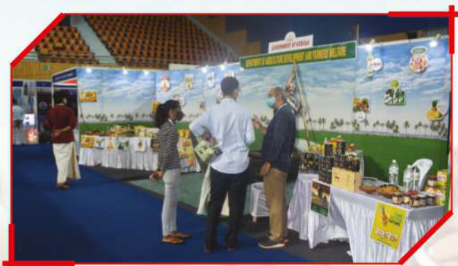
Government of Kerala